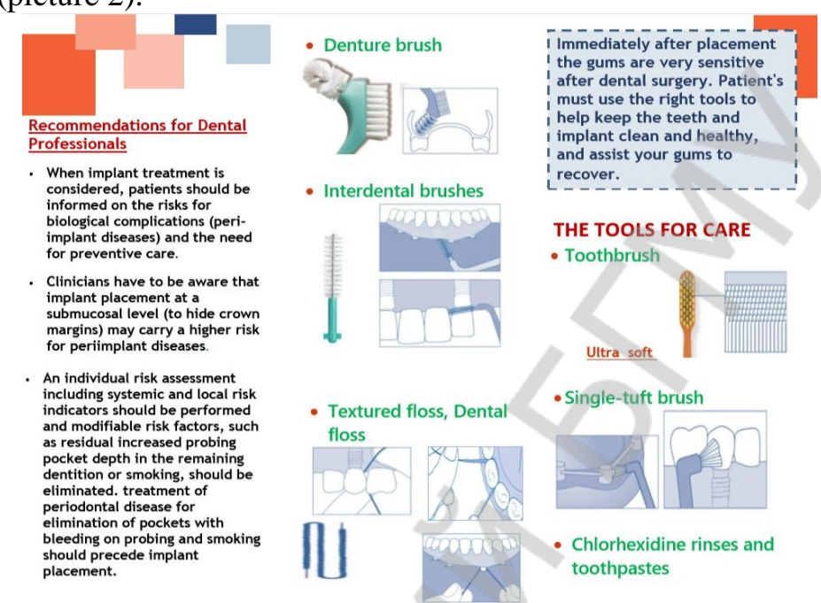
Picture 2 – Informative brochure «ORAL HYGIENE AROUND DENTAL IMPLANTS» (the 2<sup>nd</sup> page)

Immediately after placement the gums are very sensitive after dental surgery. Patient's must use the right tools to help keep the teeth and implant clean and healthy, and assist your gums to recover (picture 2).