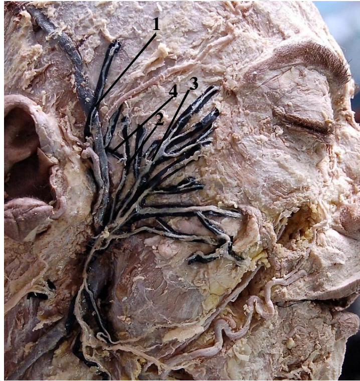
Fig. 2. Branches of the temporofacial division of the facial nerve: 1 — auriculotemporal nerve; 2 — temporal branch; 3 — zygomatic branches; 4 — connection of the temporal branch with the auriculotemporal nerve

In all cases the zygomatic branches were connected to the buccal branches, but connections with the temporal branch were not mentioned in 5 cases.