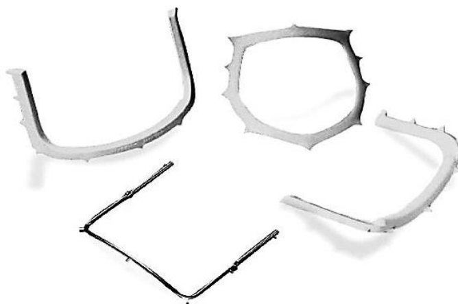
Fig. 2. Rubber dam frames

The frames (fig. 2) are made of metal or plastic material. They are sterilized by autoclaving. The frames have the points to grip the rubber dam material. For endodontic treatment it is recommended to use the frame “a mouth of a fish” from a radiolucent plastic material with a joint that makes X-ray easier.