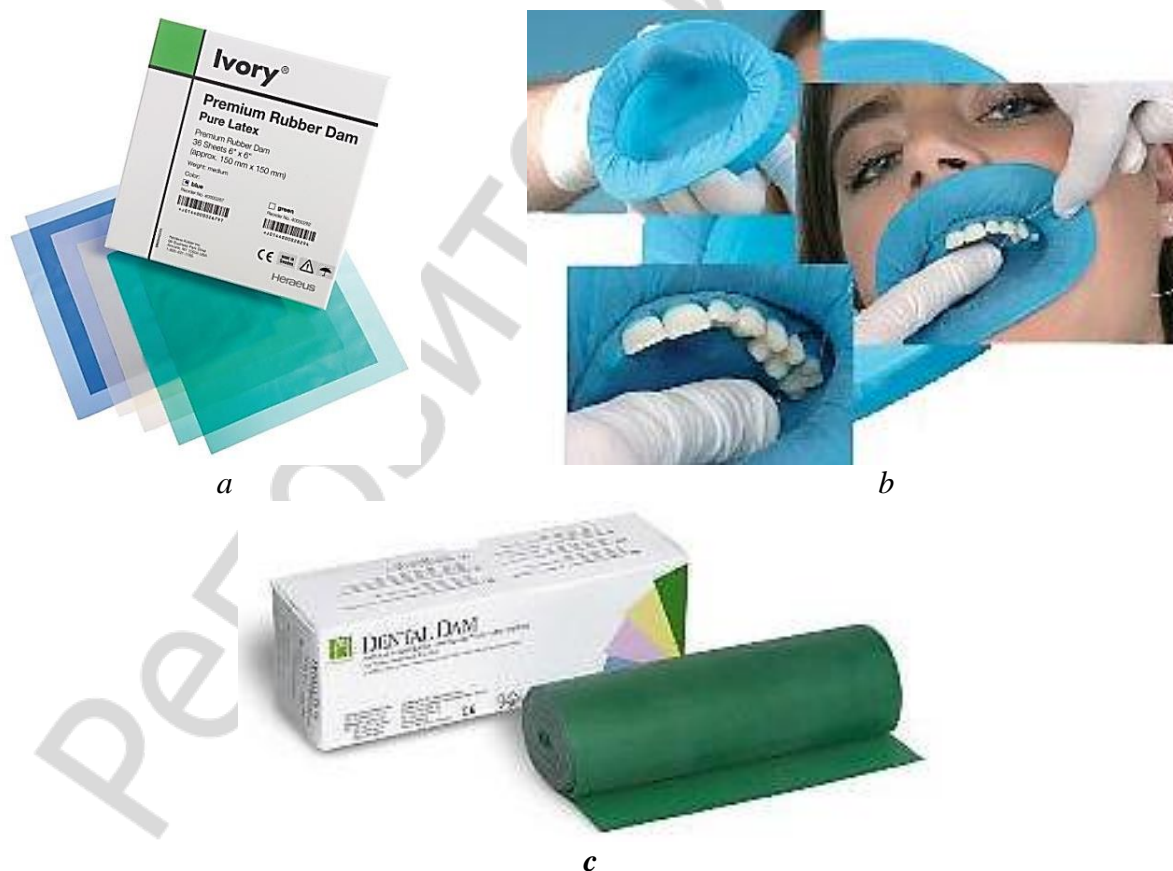
Fig. 1. Types of rubber dam: a — a rubber dam sheet; b — an opradam; c — a rubber dam roller

A rubber dam is a piece of a thin rubber easily stretched between fingers. A rubber dam is made of the best natural sources (latex) (fig. 1).