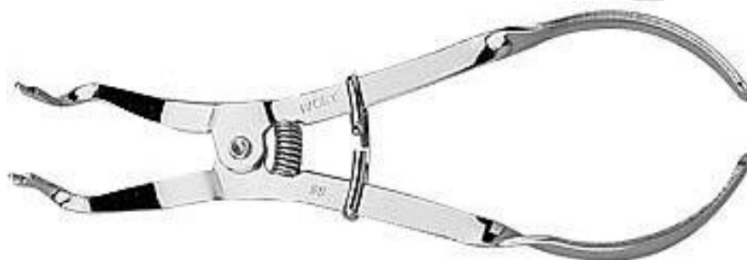
Fig. 4. Rubber dam clamp forceps

Rubber dam clamp forceps (fig. 4) have points to hold the clamps and stops which enable the clamp to be pressed on the tooth. The stops prevent the clamp forceps slipping when the clamp is placed in position.