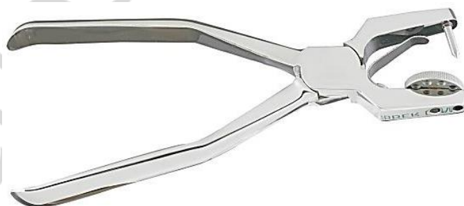
Fig. 3. Rubber dam punch

A rubber dam punch (fig. 3) ensures neat holes of any required diameters. It is possible to make holes for incisors, cuspids, premolars and molars.