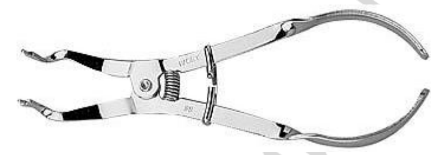
Fig. 4. Rubber dam clamp forceps

Rubber dam clamp forceps (fig. 4) have points to hold the clamps and stops which enable the clamp to be pressed on the tooth. The stops prevent the clamp forceps slipping when the clamp is placed in position.