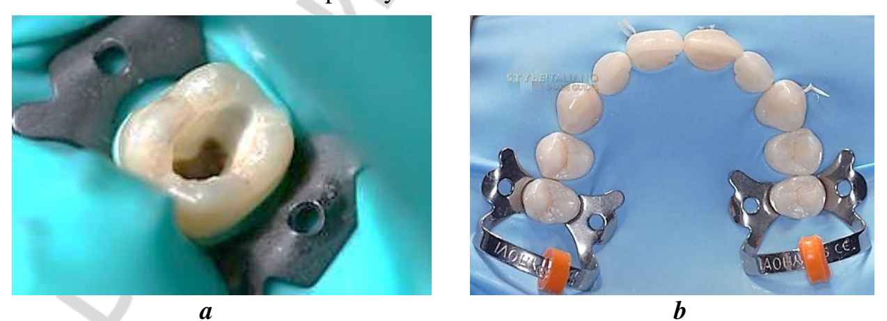
Fig. 6. Rubber dam placement a — for endodontic treatment; b — for restorations on the frontal teeth

5. It is also possible to punch eight holes instead of seven (fig. 6, b). The second largest hole in the Ivory rubber dam punch is used at both ends of the arch. When doing so, two W1 clamps are put on the tray and are later used to hold both sides of the rubber dam. The assistant should put a dish containing a small amount of shaving soap on the tray, immediately prior to placement. The shaving soap lubricates the rubber dam while it is being slid between the contact points. Vaseline is unsuitable for this purpose as it is insoluble in water and is difficult to remove completely.