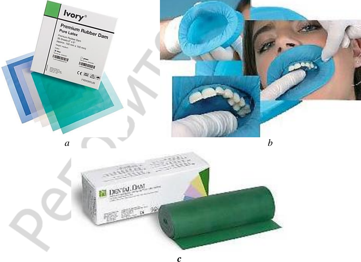
Fig. 1. Types of rubber dam: a — a rubber dam sheet; b — an optradam; c — a rubber dam roller

A rubber dam is a piece of a thin rubber easily streched between fingers. A rubber dam is made of the best natural sources (latex) (fig. 1).