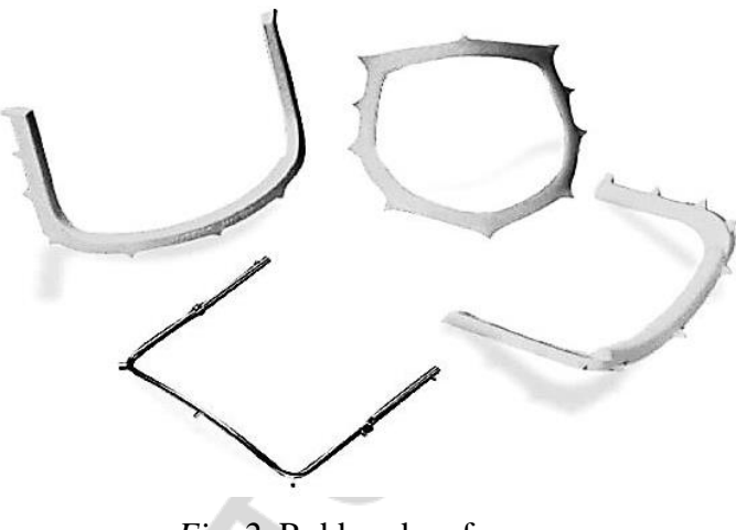
Fig. 2. Rubber dam frames

The frames (fig. 2) are made of metal or plastic material. They are sterilized by autoclaving. The frames have the points to grip the rubber dam material. For endodontic treatment it is recommended to use the frame "a mouth of a fish" from a radiolucent plastic material with a joint that makes X-ray easier.