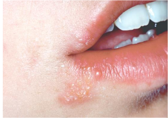
Fig. 2. Secondary (recurrent) HSV infection

Differential diagnosis. Systemic signs and symptoms coupled with the oral ulcers may require differentiation from streptococcal pharyngitis, erythema multiforme, and acute necrotizing ulcerative gingivitis (ANUG, or Vincent's infection). Clinically, streptococcal pharyngitis does not involve the lips or perioral tissues, and vesicles do not precede the ulcers. Oral ulcers of erythema multiforme are larger, usually without a vesicular stage, and are less likely to affect the gingiva. ANUG also commonly affects young adults; however, oral lesions are limited to the gingiva and are not preceded by vesicles. Moreover, considerable pain and oral malodor are often reported with ANUG.