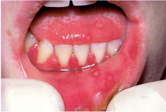
Fig. 1. Primary HSV infection

inclusions), serology (IgM and IgG titers), immunohistochemistry, or polymerase chain reaction (PCR) testing.