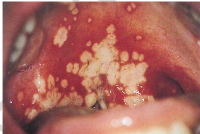
Fig. 5. Herpangina: numerous shallow ulcers on the soft palate

Clinical features. Herpangina is a vesicular enanthem (rash on the mucous membranes) and is more common in children aged 3 to 10 than in adults. The disease presents with an acute onset of fever, sore throat, dysphagia, headache, and malaise, followed by diffuse erythema and vesicles. The vesicles are small and numerous, and rupture rapidly, leaving painful ulcers that heal within 7–10 days (Fig. 5). Characteristically, the lesions appear on the soft palate and uvula, tonsillar pillars, and posterior pharyngeal wall. No associated exanthema (skin rash) is typically seen.