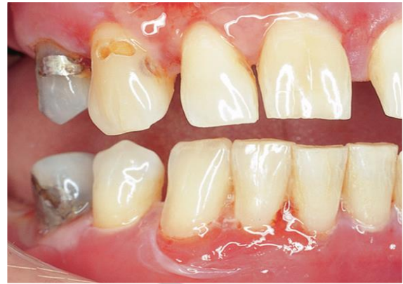
Fig. 12. Mucous membrane pemphigoid of the gingiva

Diagnosis. Patients with suspected MMP should have biopsy specimens taken for both routine and DIF studies. The specimen for routine histology and DIF should be taken from the edge of an ulcer, vesicle, or erythema and tissue. Histopathology reveals subepithelial clefting with preservation of basal cells and variable inflammation. Direct immunofluorescence shows basement membrane linear distribution of IgG, complement fraction 3, and IgA.