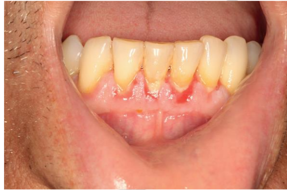
Fig. 10. Pemphigus vulgaris presenting as erosions of the gingiva

Diagnosis. Diagnosis is made on the basis of history and examination, biopsy and blood tests. Biopsy is necessary to distinguish the condition from other vesiculobullous disorders and to confirm the presence of autoantibodies in the tissues. It is important to biopsy peri-lesional rather than lesional tissue. Pemphigus vulgaris appears as intraepithelial clefting with keratinocyte acantholysis. Loss of desmosomal attachments and retraction of tonofilaments result in free-floating, or acantholytic, Tzanck cells. Bullae are suprabasal, and the basal layer remains attached to the basement membrane.