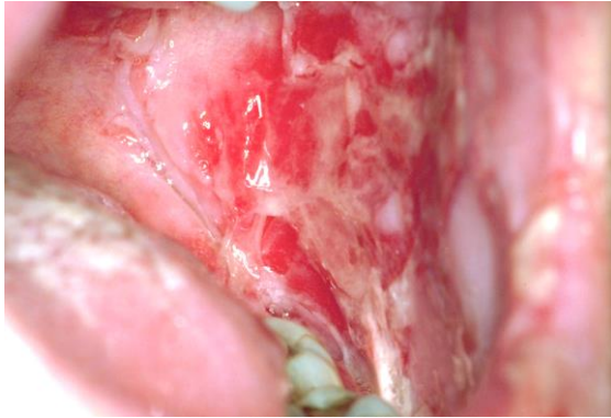
Fig. 9. Oral pemphigus vulgaris

the bullae rapidly break. The edges of the lesion continue to extend peripherally over a period of weeks until they involve large portions of the oral mucosa. The lesions are usually painful. Most commonly, the lesions start on the buccal mucosa, often in areas of trauma along the occlusal plane (Fig. 9). The palatal mucosa and gingiva are other common sites of involvement. In some cases, the lesions may start on the gingiva as desquamative gingivitis (Fig. 10).