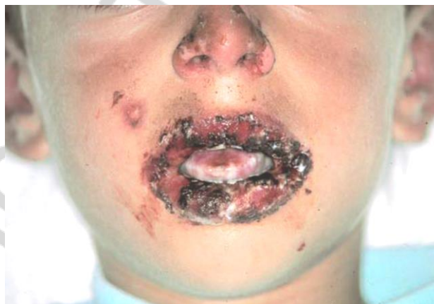
Fig. 8. Stevens–Johnson syndrome: severe erosions on the lips, tongue, and the nose in an 8-year-old boy

Clinical features. Adults between the age of 20 and 40 are most commonly affected, with 20 % of the cases occurring in children with a slight predilection for females. The oral lesions are always present, and are characterized by extensive bullae, erosions, ulcers, and hemorrhagic crusts on the vermilion (Fig. 8). The lesions may extend to the pharynx, larynx, and esophagus. The ocular lesions consist of conjunctivitis, uveitis, symblepharon, or even panophthalmitis. The genital lesions are balanitis or vulvovaginitis, and scrotal erosions. The skin lesions of SJS are different from EM. They are more severe and tend to arise on the chest rather than the extremities on erythematous and purpuric macules; these lesions are called “atypical targets.”