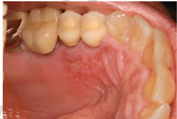
Fig. 4. Herpes zoster of the palate

Diagnosis. The clinical presentation is usually characteristic. Unilateral segmental distribution, prevalence in adults, and severe pain are features that allow for clinical diagnosis. Laboratory testing includes the same methods as with HSV infection.