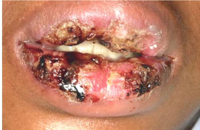
Fig. 7. EM with hemorrhagic crusts of the lips

The oral findings in EM range from mild erythema and erosion to large painful ulcerations. Short-lived vesicles or bullae are infrequently seen at initial presentation. Within the mouth any area may be involved, with the lips, buccal mucosa and tongue being most frequently affected. Extensive lip involvement with inflammation, ulceration, and crusting (Fig. 7) is common, but not always present. The symptoms range from mild discomfort to severe pain.