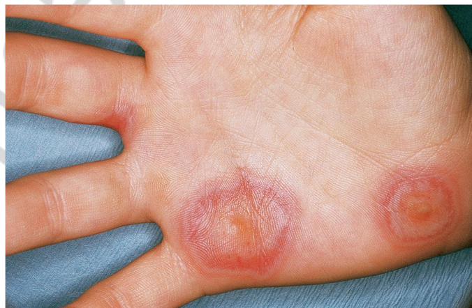
Fig. 6. EM cutaneous target lesions

Clinical features. Young adults are most commonly affected. Individuals often develop EM in the spring or fall and may have such recrudescences chronically. There may be a prodrome of fever, malaise, headache, sore throat, rhinorrhea, and cough. The term erythema multiforme was coined to indicate the multiple and varied clinical appearances that are associated with cutaneous manifestations of this disease. The classic skin lesion of EM is the target or iris lesion (Fig. 6). It consists of a central blister or necrosis with concentric rings of variable color. Typically, the extremities are involved, usually in a symmetric distribution. Other types of skin manifestations of EM include macules, papules, vesicles, bullae, and urticarial plaques.