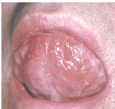
Fig. 13. Multiple vesicles and small ulcers appearing as a manifestation of allergy to various substances

fragrances, preservatives, base ingredients and UV-filters. Intraepithelial vesicles are present. In microscopic examination the vesicular contents are composed of an eosinophilic exudate and an acute inflammatory cell infiltrate composed of both neutrophils and eosinophils.