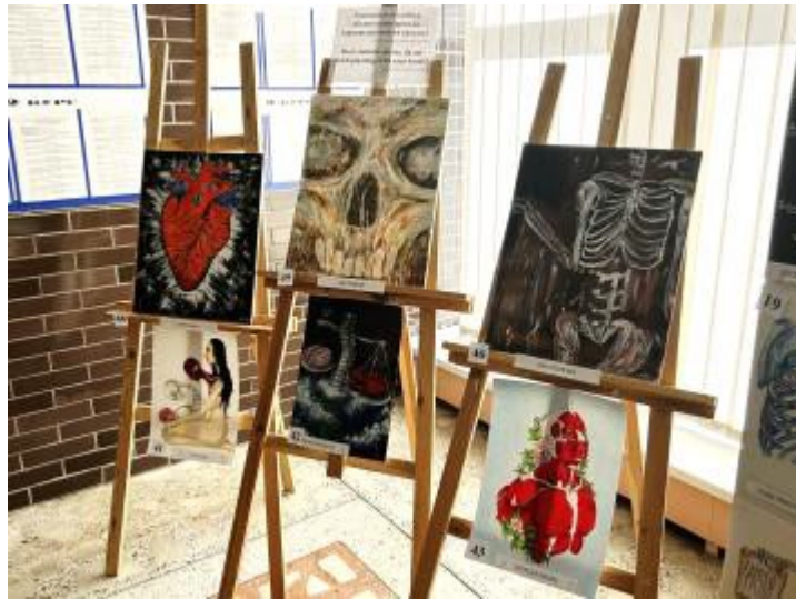
Exhibition-competition of anatomical drawing, dedicated to the 100th anniversary of the student scientific club 'Normal Anatomy', ARS ANATOMICA.

Thus, on this day, like no other, the Belarusian Scientific Society of Morphologists had the opportunity to note the importance of anatomy as an academic discipline and show its important role in the training of healthcare specialists. The organisation of such events dedicated to outstanding scientists and teachers has become a tradition for the staff of the Department of Normal Anatomy of BSMU.